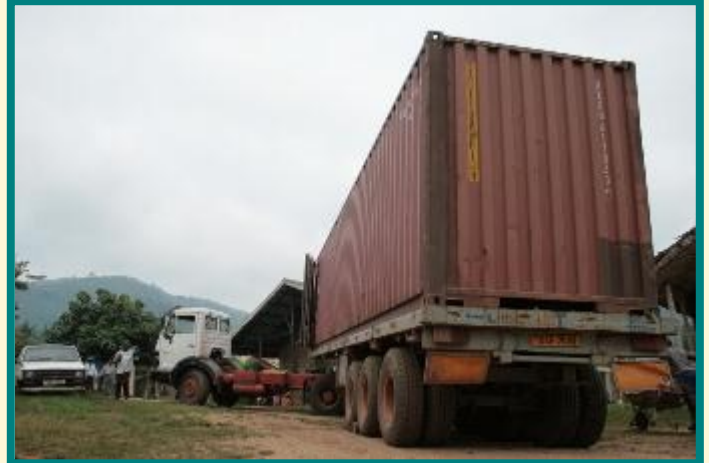
The 40-foot container arrives at BCH.

Therefore BCH requested the Uganda People's Defense Force (UPDF) for help. And they granted it. On Saturday the 29 th they showed up with an Amphibious Infantry Fighting Vehicle. . With this tank the UPDF would pull the container from the trailer, after unloading the medical equipment.