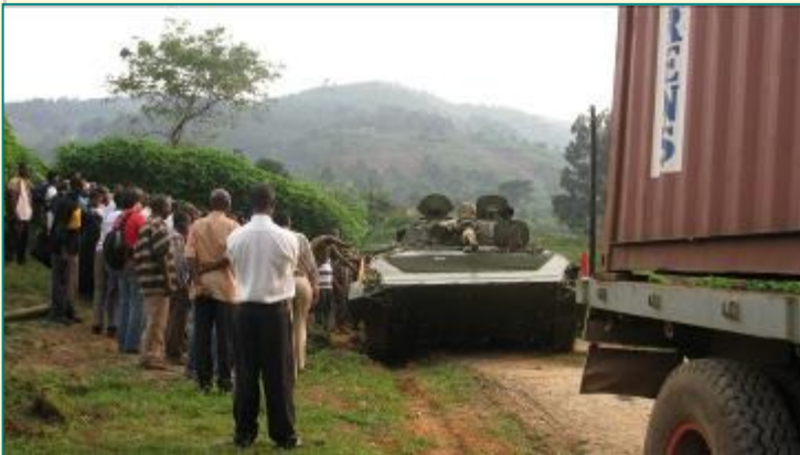
A UPDF tank pulls the container.

The remainder of the container was filled with 1,045 cartons of medical supplies, ranging from bandages to surgical tools, which will help every department in the hospital. The entire shipment of donated goods was valued at $195,580 and container itself has remained on site at the hospital, where it will be retrofitted to serve as a workshop.